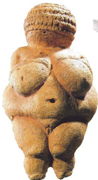
Venus von Willendorf